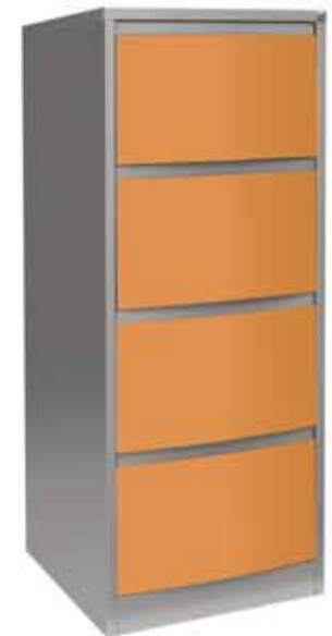
4 DRAWER 2.26LM 1264H X 476W X 644D