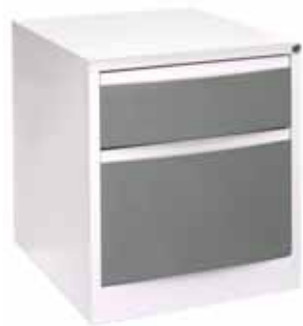
1½ DRAWER 0.57LM 605H X 476W X 644D WITH OR WITHOUT CASTERS