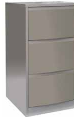
3 DRAWER 1.70LM 972H X 476W X 644D