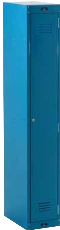
^ 1 TIER