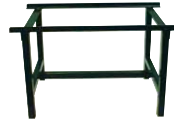
^ LOCKER STAND