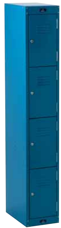
^ 4 TIER