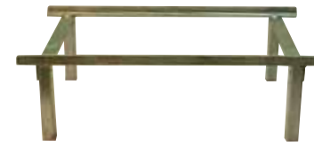
^ LOCKER PLINTH