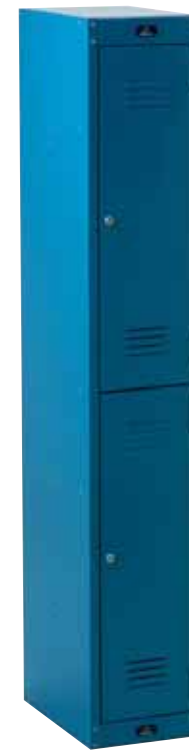
^ 2 TIER