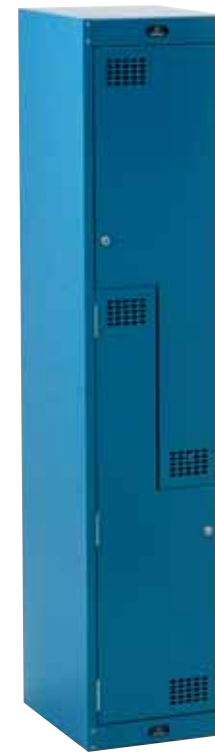
^ 2 STEP