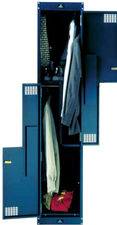
^ 2 STEP (OPEN)