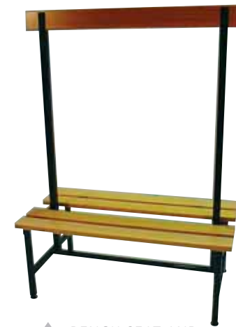
^ BENCH SEAT AND TOWEL RAIL