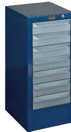
▲ 7 DRAWER CABINET