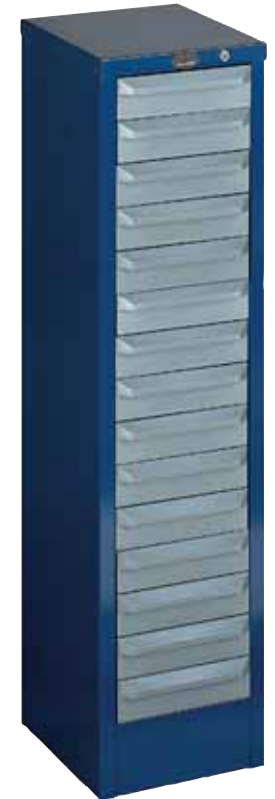
▲ 15 DRAWER CABINET