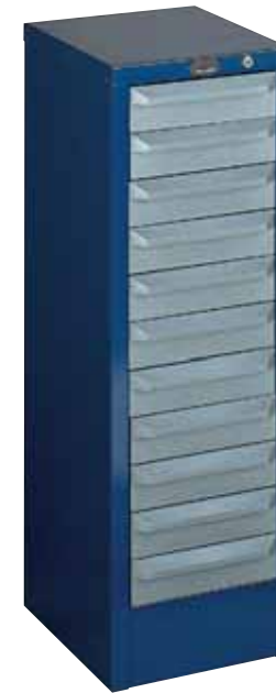
▲ 11 DRAWER CABINET